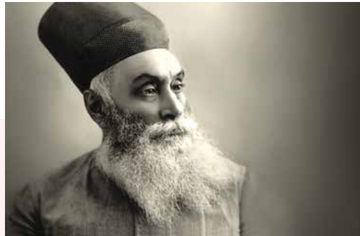
JAMSETJI NUSSERWANJI TATA (1839-1904)