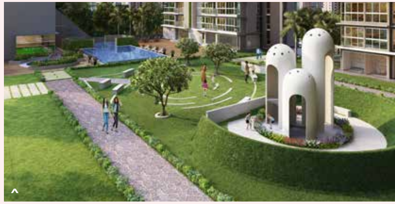
Lawn & Kids Area