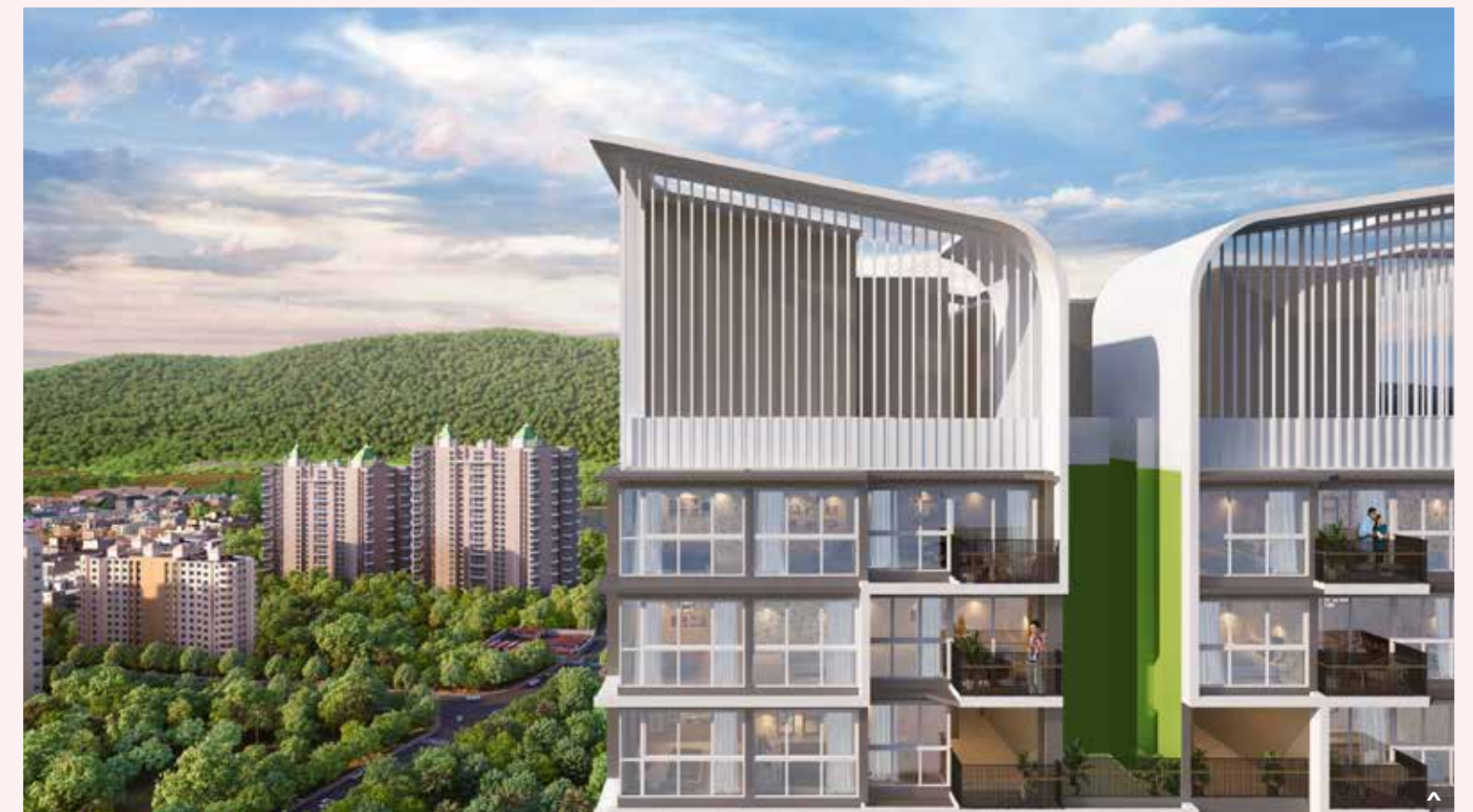
Thick green cover of Yeoor Hills