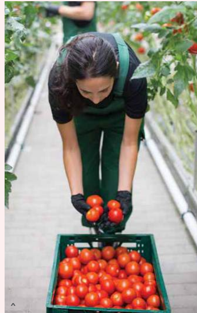
Organic garden with outdoor deck