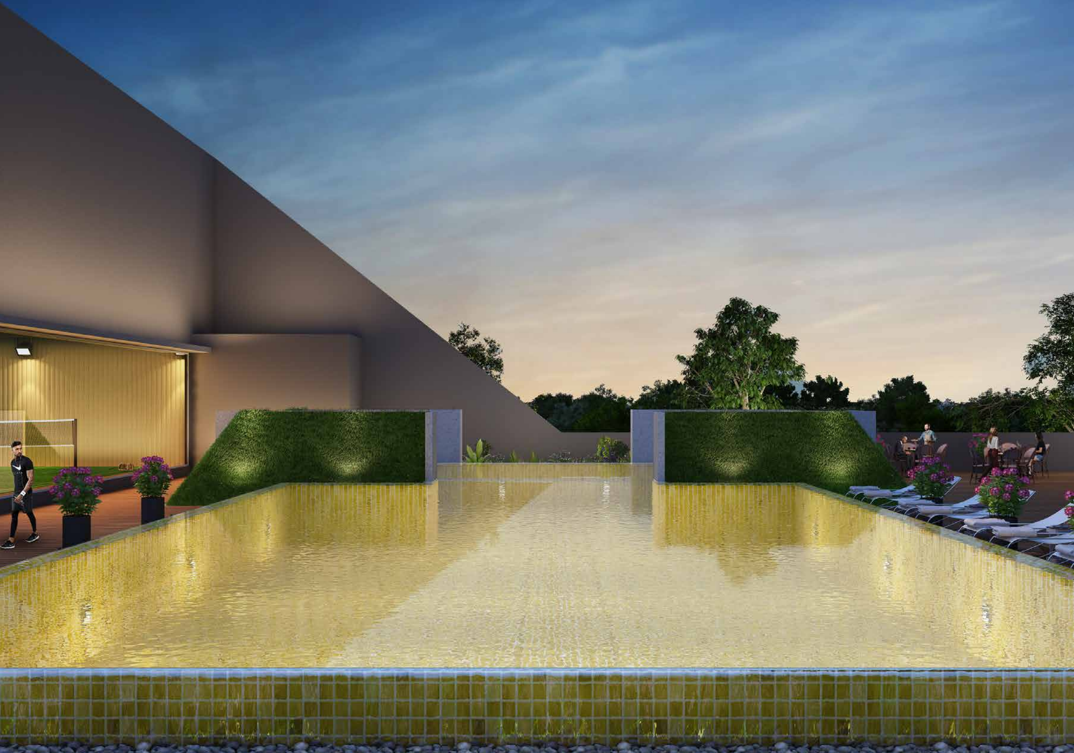
Evening View of Swimming pool