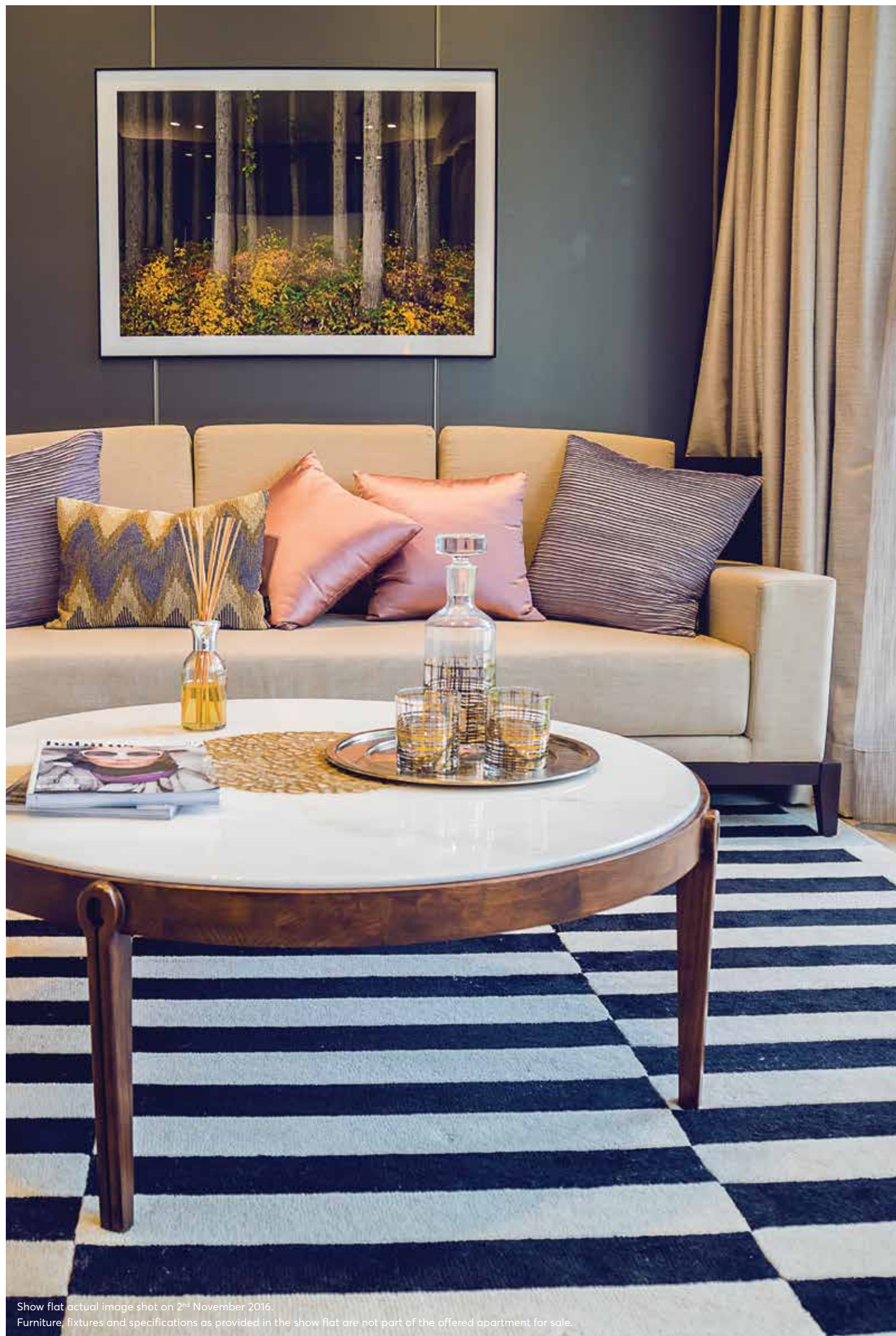
Show flat actual image shot on 2 nd November 2016. Furniture, fixtures and specifications as provided in the show flat are not part of the offered apartment for sale.