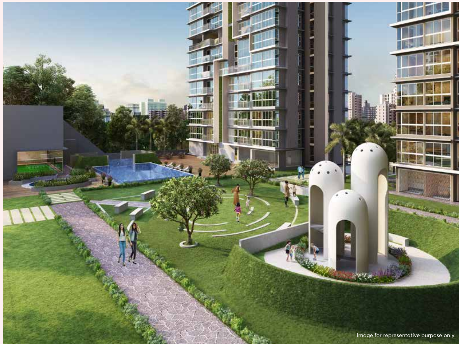
Lawn & Kids Area

SEREIN IS MORE THAN A RESIDENTIAL ADDRESS.